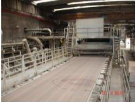
Flat Fourdrinier in stainless steel by TOSCHI