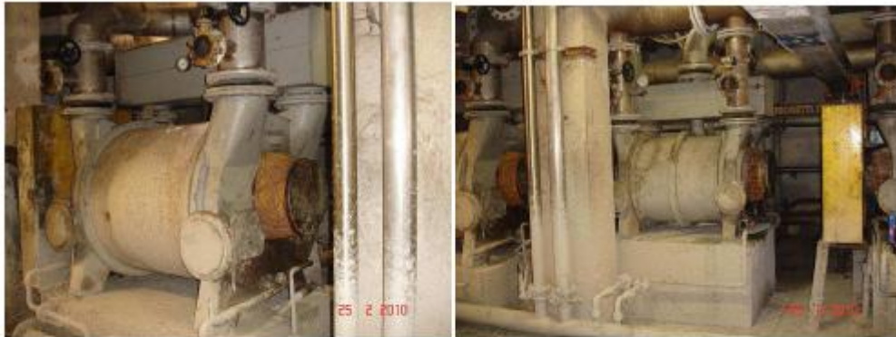
Nr. 4 Siemens Vacuum pump