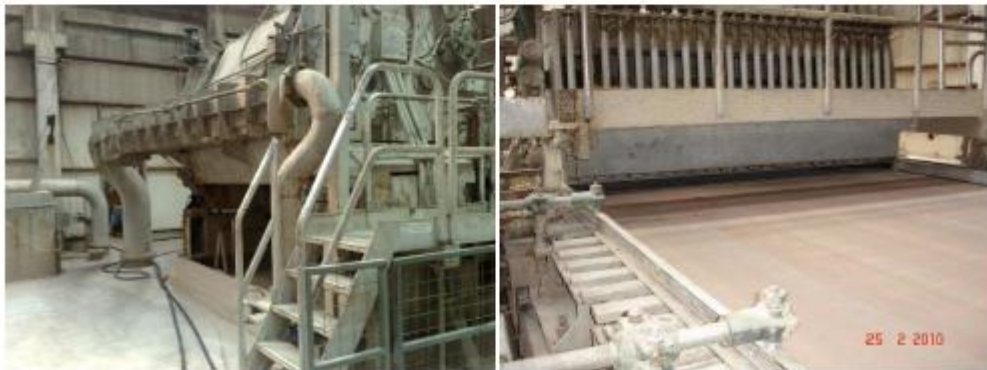
ST Hydraulic Head box built in 1995