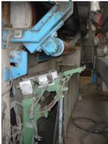
Automatic tail passage