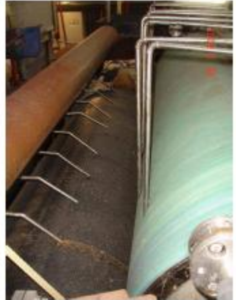
Post Dryer section by Toschi (10 Bar Cylinders!!)