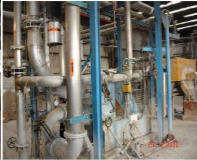
Nr. 1 Ultrascreen Black Clawson