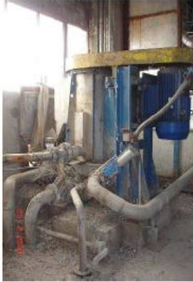
Nr. 1 Combisorter Voith