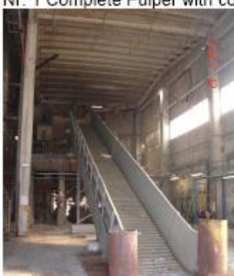
Nr. 1 Complete Pulper with conveyor